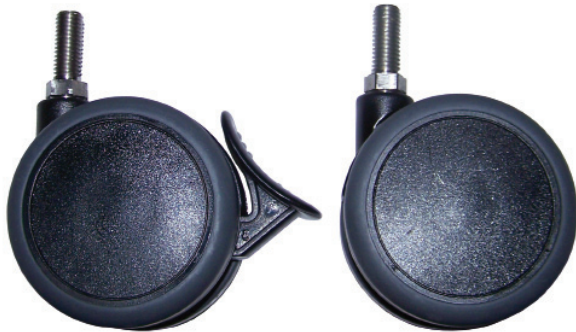
22-40/22-44 Twin-wheel 3" Casters with/without brake